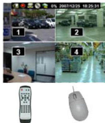
Multiple operation control: Mouse / IR controller.