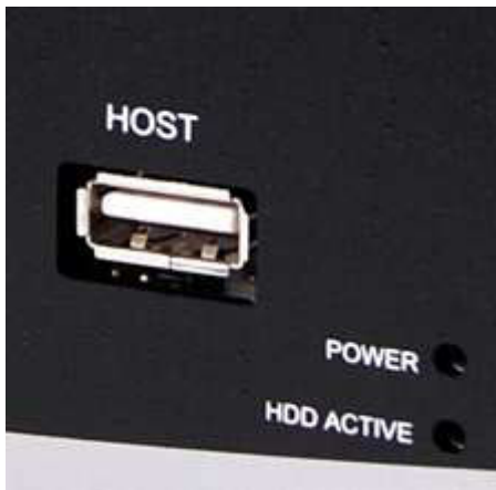
The USB connector on the front panel of DVR is only for backup and firmware update.